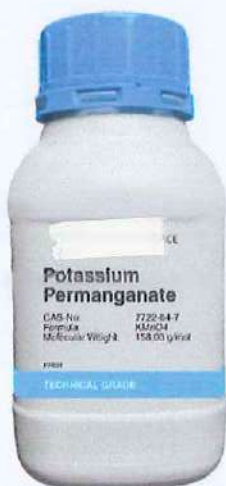
Potassium permanganate, Technical