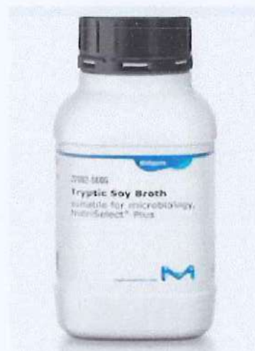
Tryptic soy broth