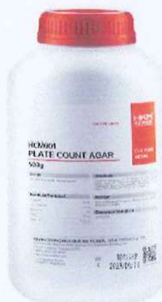
Plate Count Agar