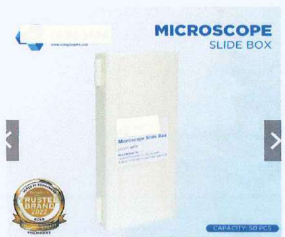
50's Plastic Microscope Slide box