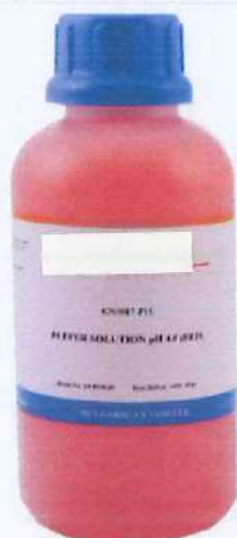
Buffer solution pH4, red colored (LOBA Chemie)