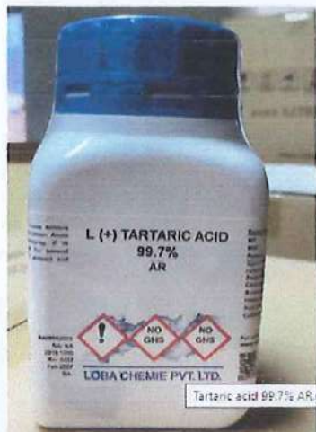
Tartaric Acid (LOBA Chemie)