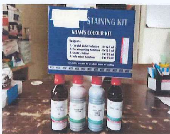
Gram's Stain Set(LOBA Chemie)