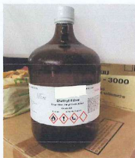
Diethyl Ether (Labscan)