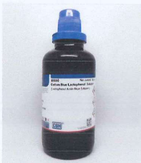
Lactophenol cotton blue