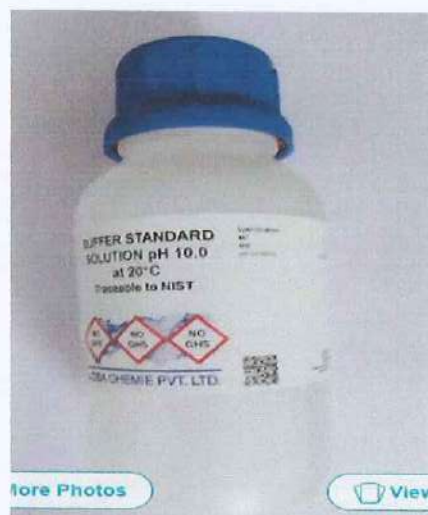
Buffer pH 10