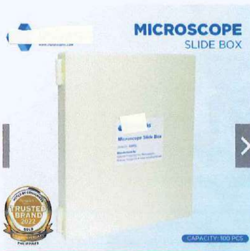
100's Plastic Microscope Slide box