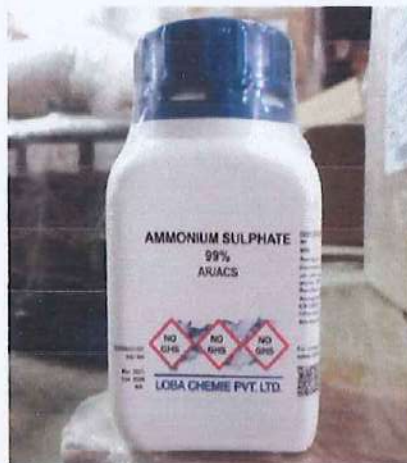
Ammonium sulphate, AR (LOBACHEMIE)